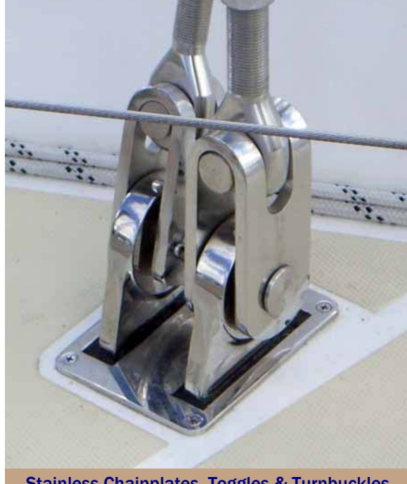
Stainless Chainplates, Toggles & Turnbuckles

This brings us to another drawback with stainless steels: How can you tell which alloy of stainless you have? I've never found a good answer to this question. The builders of these boats had specifically ordered 316 for these rails per my instructions. Nevertheless, somehow, the fabricator had used 302. Of course, new all-316 rails arrived as replacement at no cost, but all this is unwanted hassle.